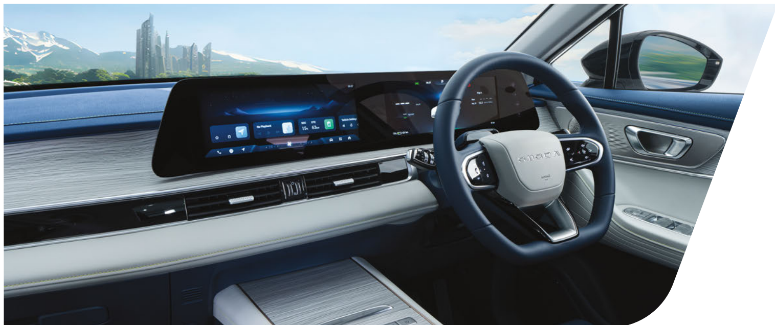
Futuristic Cabin with 24.6 inch Super Large Curved Screen