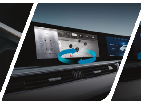
340° HD Panoramic Camera