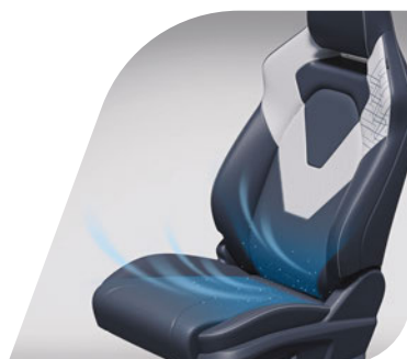
Driver & Passenger Ventilated Seat