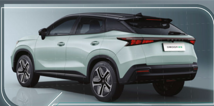
Light & Shadow Cutting Streamlined Body