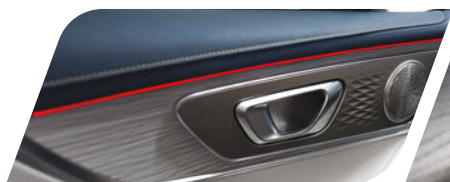
Multi-Color Interior with Soft Touch Material