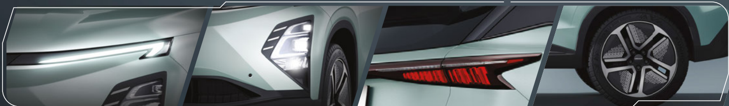
LED Daytime Running Lamp (DRL)