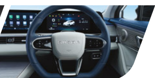
Multi-Fuction Steering Wheel