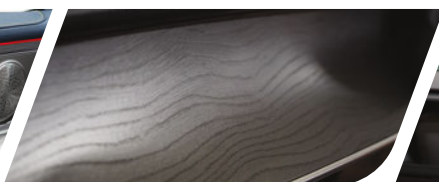
Special Wood Panel Dashboard