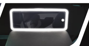
Futuristic Sunvisor with New Tech-Light System