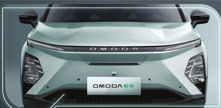
X Future Tech Front