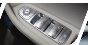
Power All Window