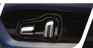
Driver and Passenger Electric Seat Adjuster