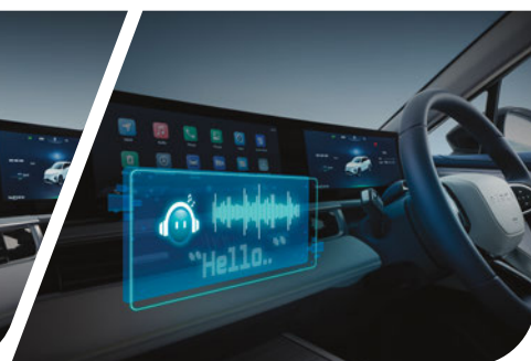
Intelligent Voice Assistant