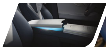
Front Armrest with Cooling System