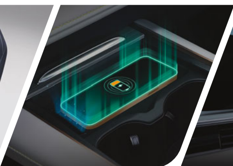
50w Smartphone Fast Wireless Charger with Cooling System