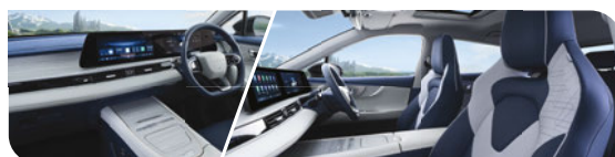
Blue & Beige

*The colour of vehicle(s) shown here may vary from the actual models.