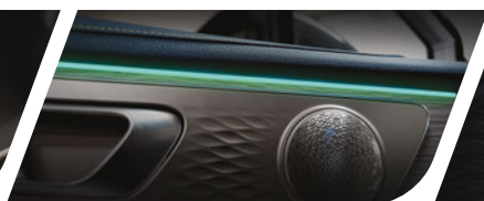
Multi-Color 1st Row & 2nd Row Ambient Light