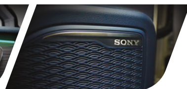
Sony B Speakers